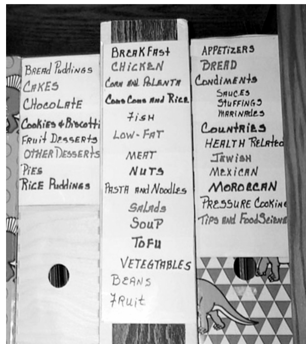
Figure 5. A closer look at the classification system.

The twelve household tours generated a data set of 70 single spaced pages of narrative and 125 photographs (see Figures 4 and 5). These materials shed light on the substantive content of hobby cooking;